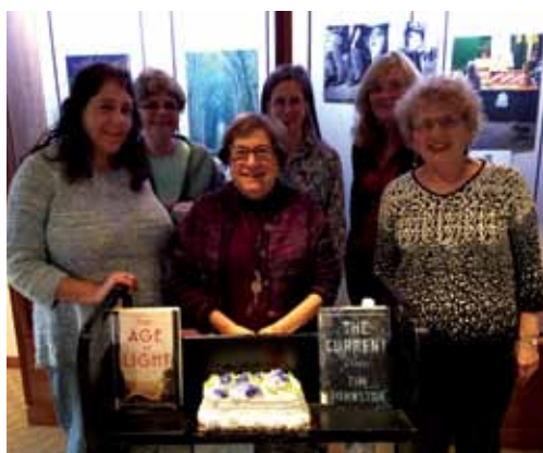
Members of the Book Lovers' Circle Celebrate the 7th Anniversary of their first meeting!